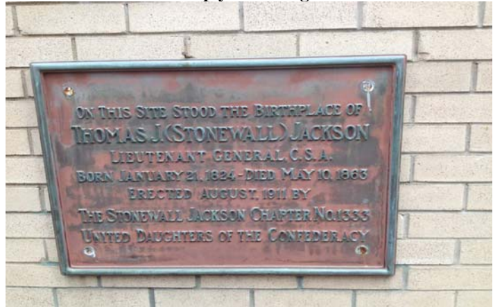
Figure 5 - On Main Street