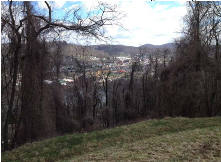
Figure 3 - The View from Federal Trenches Looking Over Clarksburg to the B&O