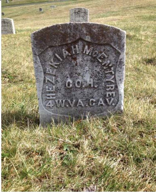
Figure 1 - Federal Graves in Elkview Cemetery, the start of my Saturday morning walk

The newsletter of the West Virginia Reenactors Association 2015 – Edition 5 – April