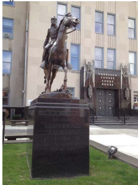
Figure 6 - Stonewall