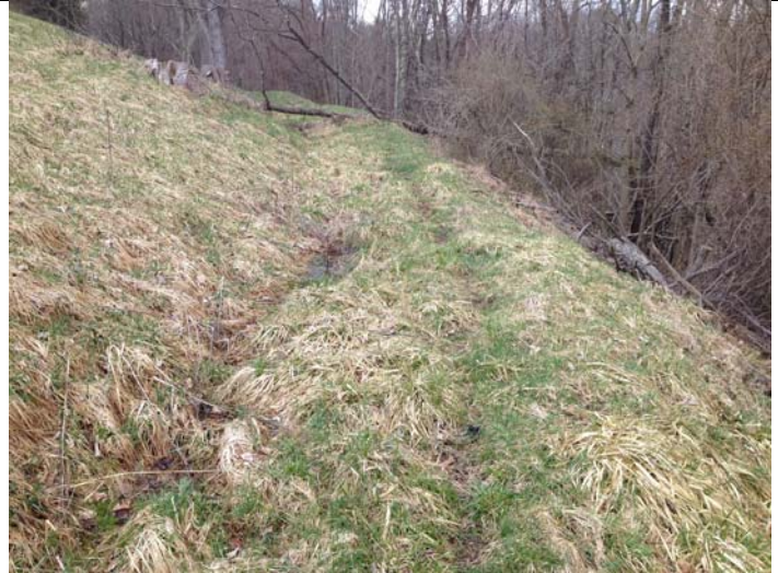
Figure 4 - The Remnants of the Federal Trenches Looking Northwest. Hill falls steeply to the Right towards town