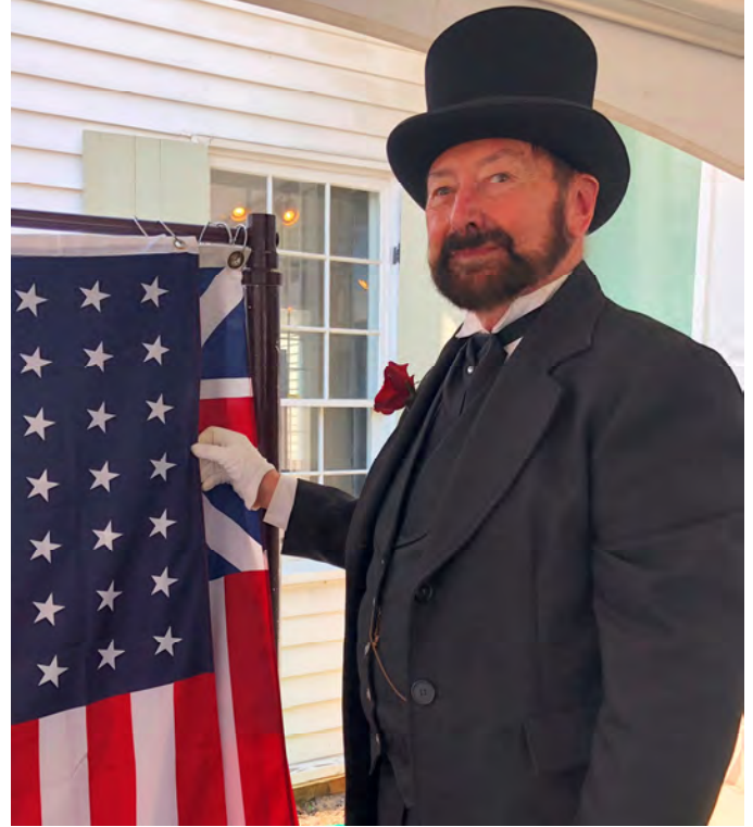
Figure 5 - Governor Francis Pierpont portrayal by Art Dodds