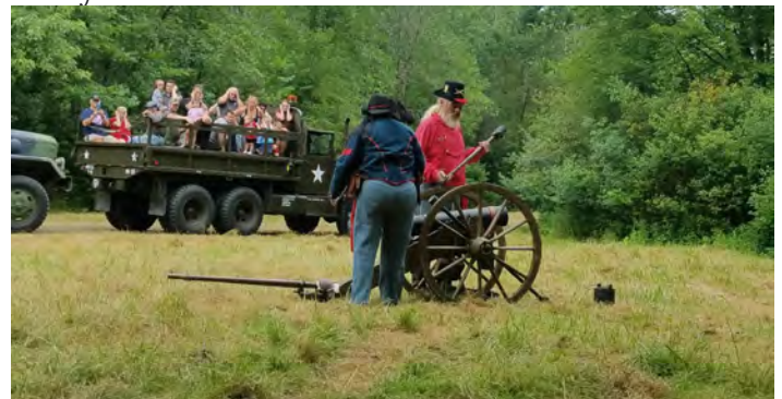
1st West Virginia Artillery, Battery B, preparing to fire at Ride Through History event as spectators watch from World War II deuce and a half.

The organizer of this event treated everyone who participated out to ice cream at a local shop they took all of us in the Deuce and 1/2 trucks it was great fun! We look forward to participating in this event again next year.