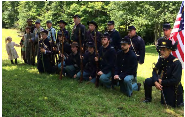
Figure 2 - The armies at Rich Mountain after the reenactment

Like all West Virginia reenactments of this year, this was a small event. I can't speak for the Beverly Living History as I was required to stay close to camp as the official site 'manager.' So I request that anyone who was in Beverly, please feel free to send a review of the proceedings in town.